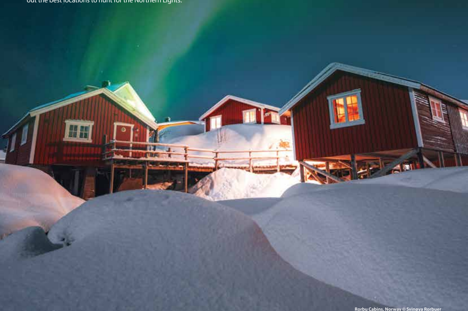
Rorbu Cabins, Norway

Includes: 3 nights in a private Rorbu cabin at Svinøya, breakfast daily, 1 dinner, excursions and transfers as shown.