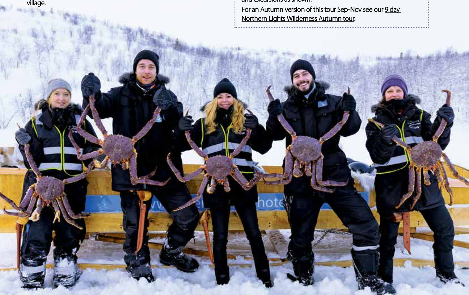
King Crab Safari

For an Autumn version of this tour Sep-Nov see our 9 day Northern Lights Wilderness Autumn tour .