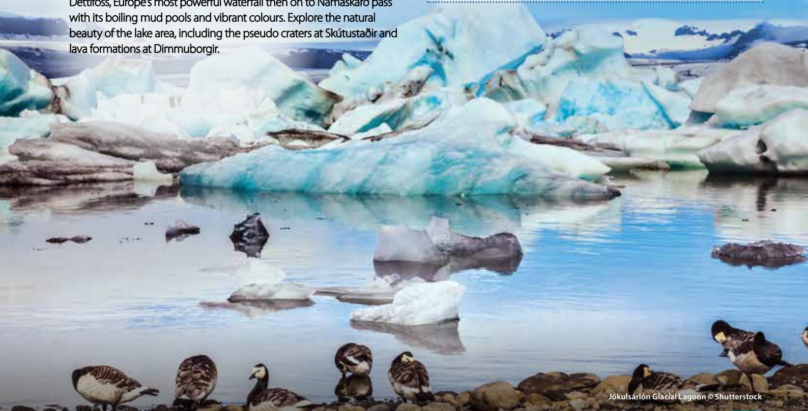
Jökulsárlón Glacial Lagoon