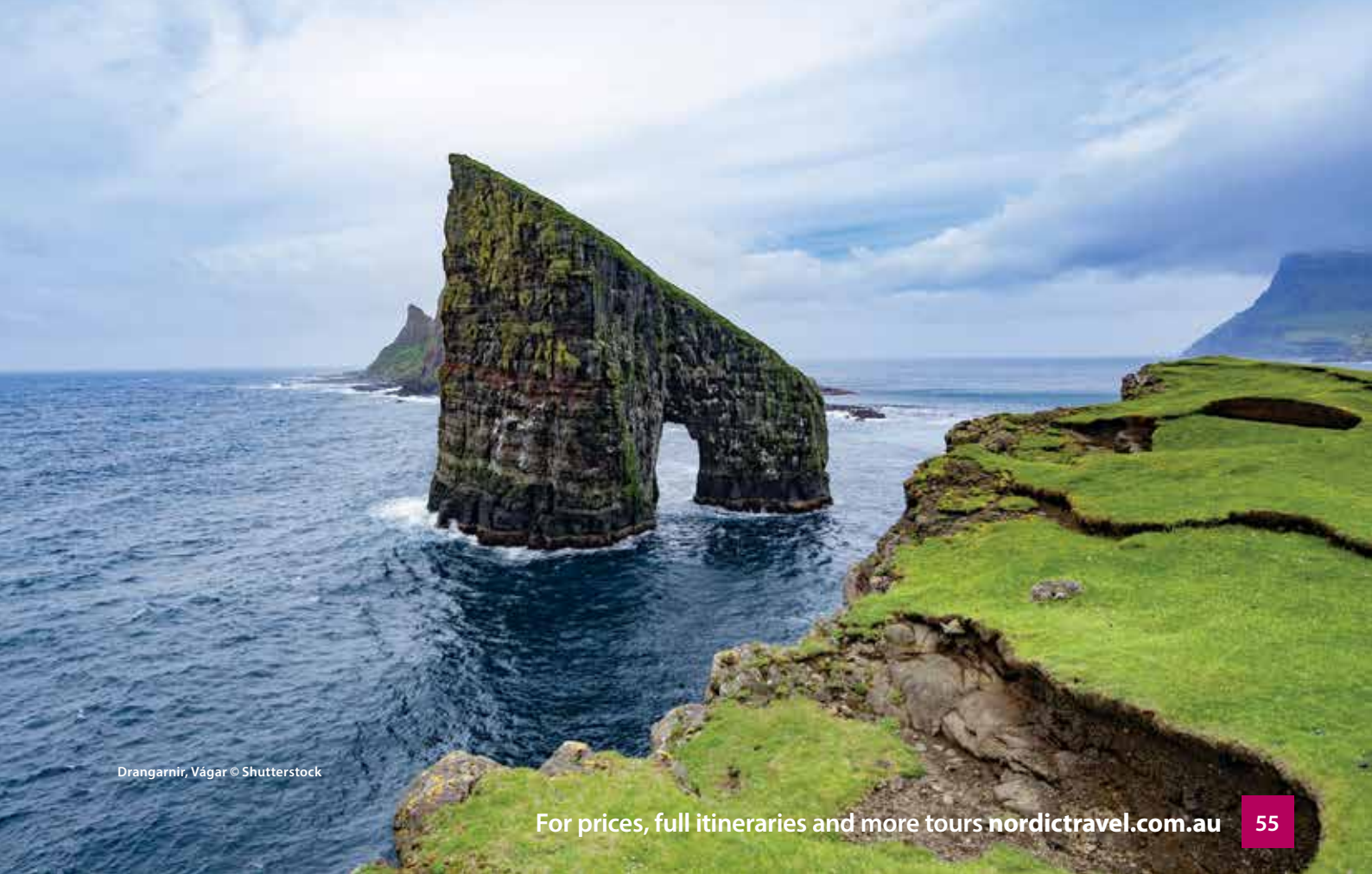
Drangarnir, Vágur