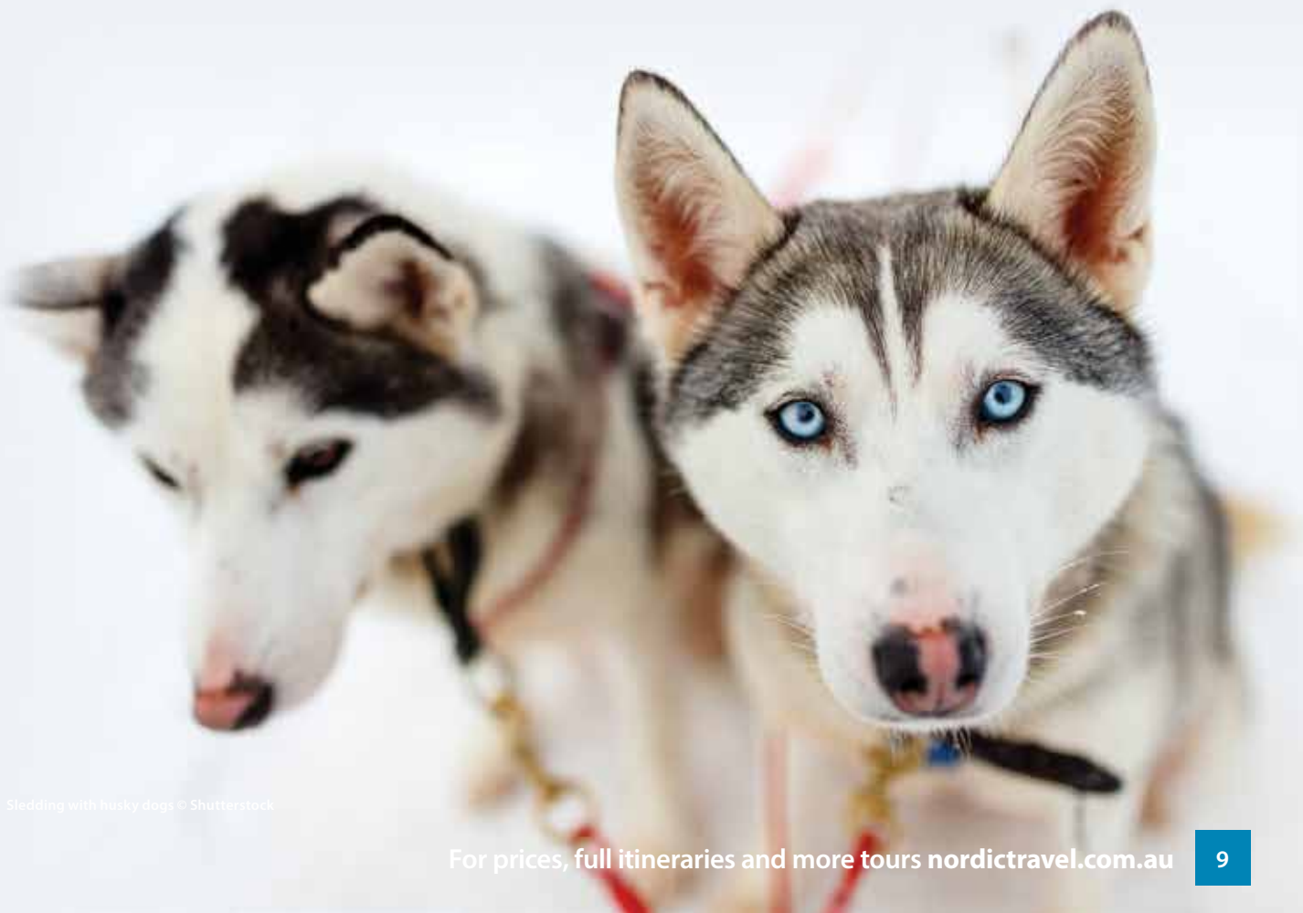
Sledding with husky dogs

Includes: 6 hotel nights, 1 overnight on train, breakfast daily, 2 lunches, 2 dinners, flight Ivalo-Helsinki, transfers, excursions and transport as shown.