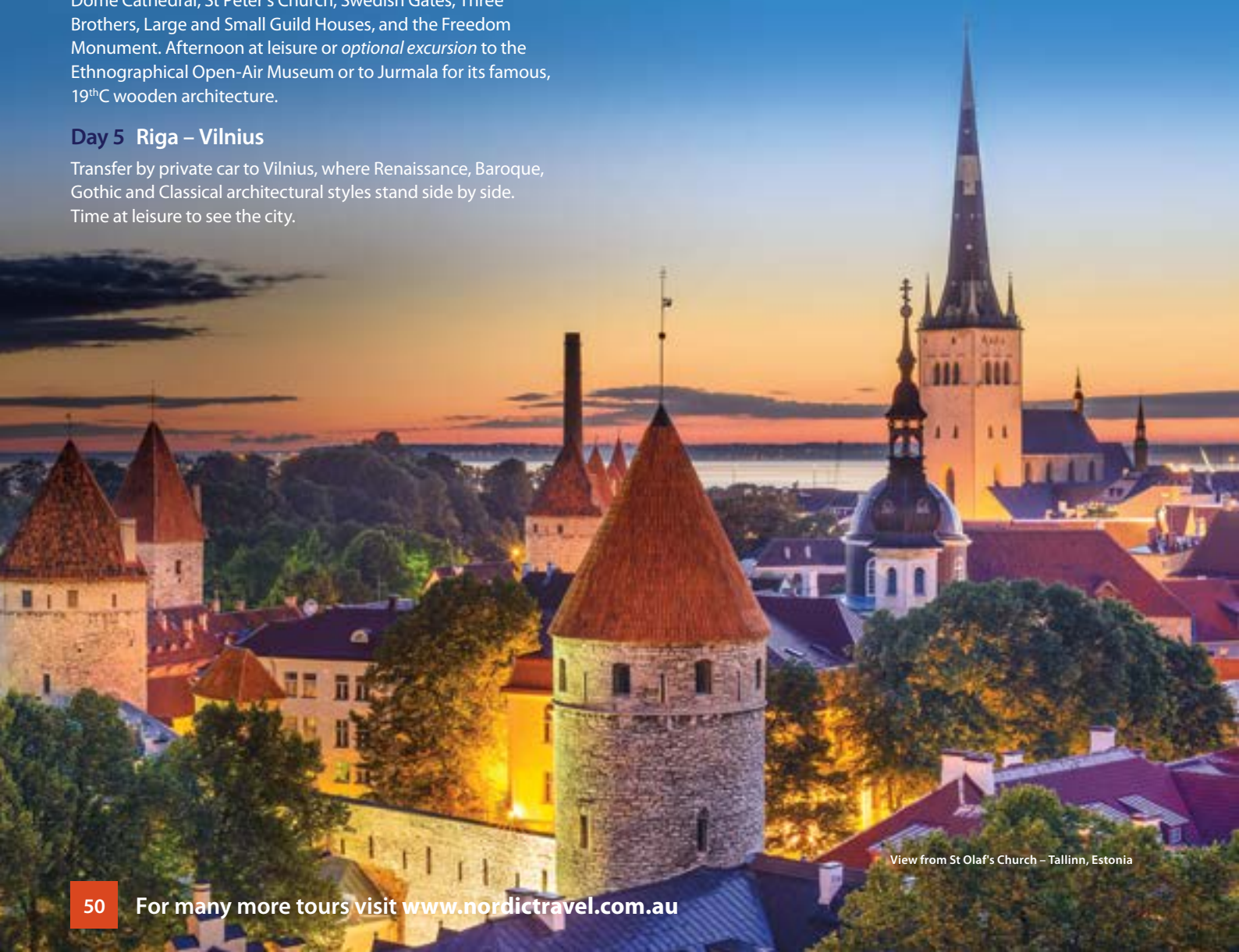
View from St Olaf's Church – Tallinn, Estonia

Prices, detailed itinerary and similar tours at www.nordictravel.com.au