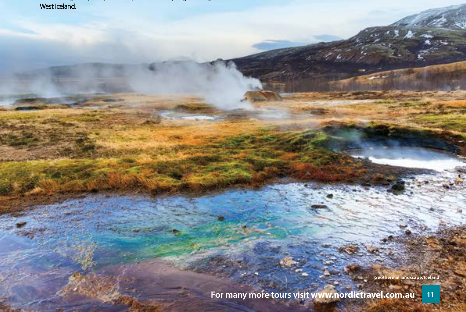
Geothermal landscape, Iceland