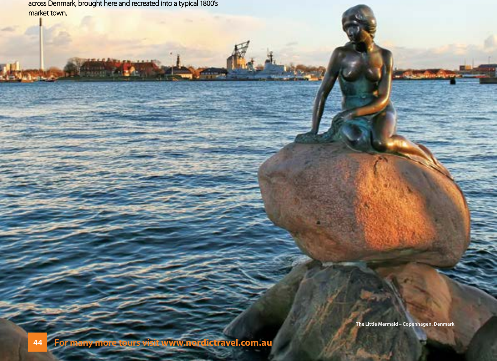
The Little Mermaid – Copenhagen, Denmark

Prices, detailed itinerary and similar tours at www.nordictravel.com.au