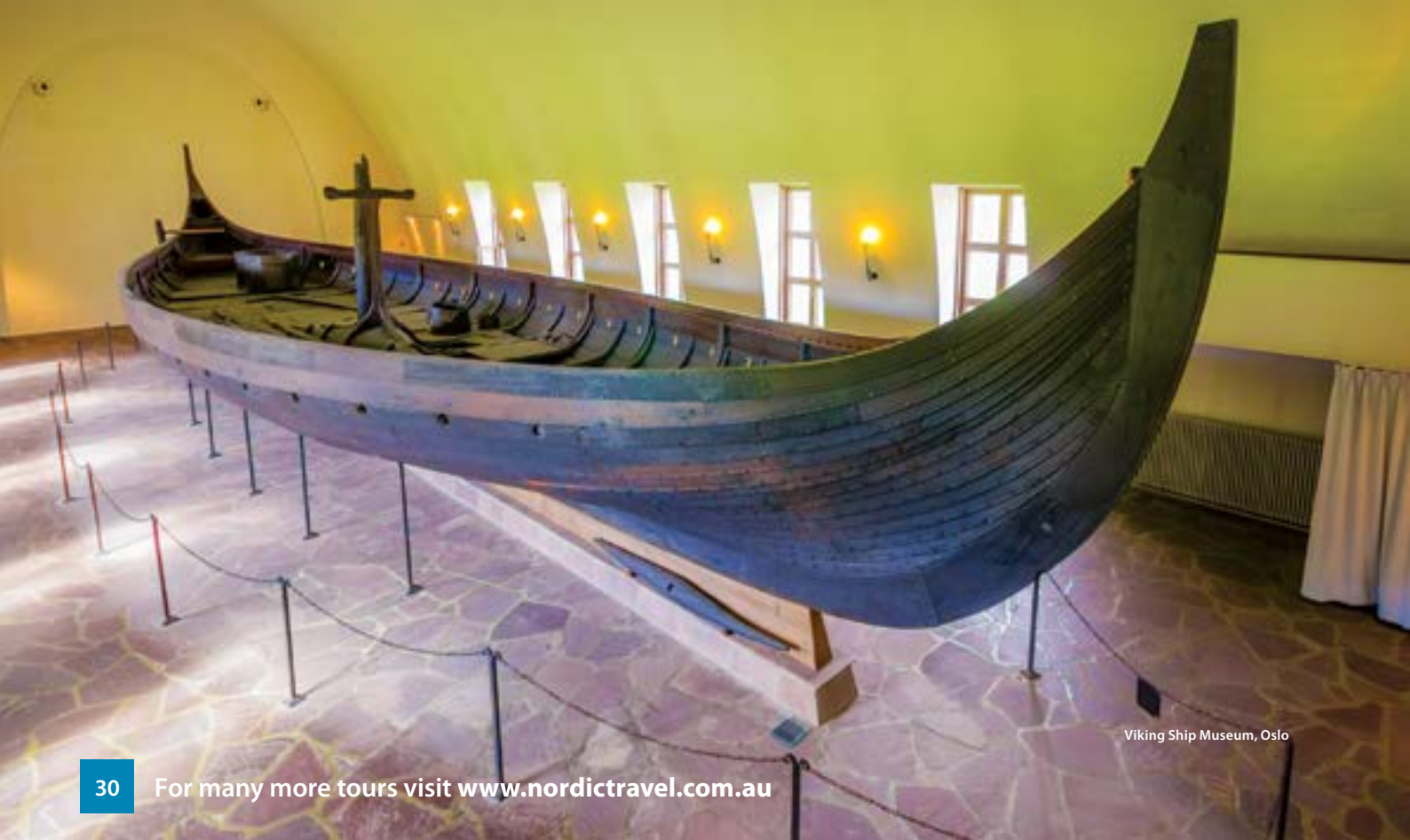
Viking Ship Museum, Oslo