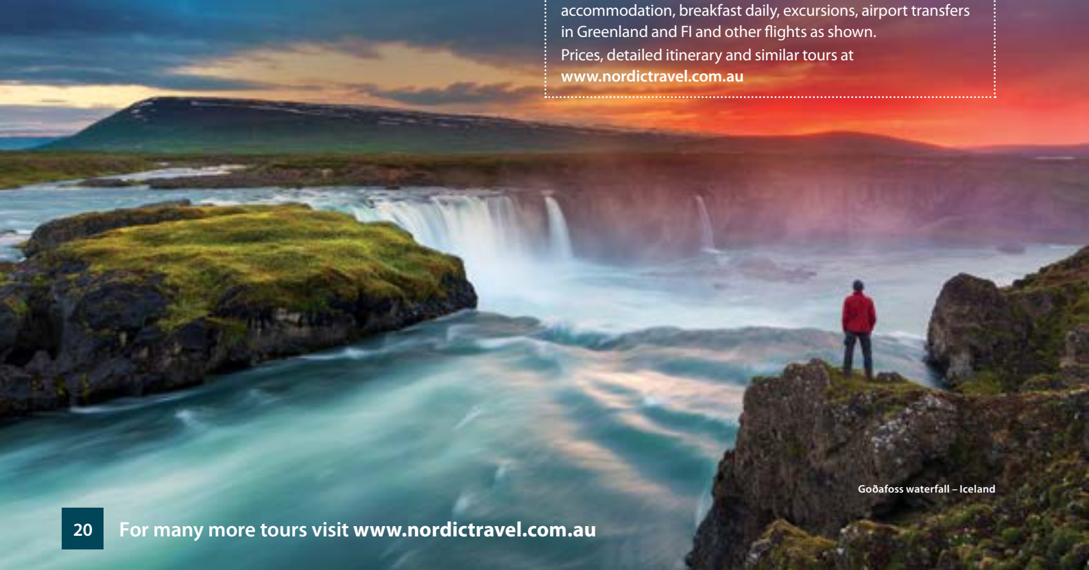
Goðafoss waterfall – Iceland

Prices, detailed itinerary and similar tours at www.nordictravel.com.au