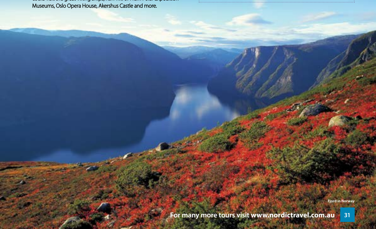
Fjord in Norway