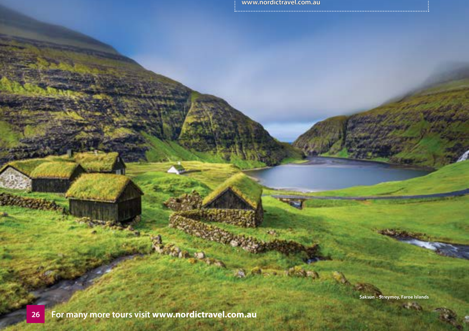
Saksun – Streymoy, Faroe Islands

Prices, detailed itinerary and similar tours at www.nordictravel.com.au