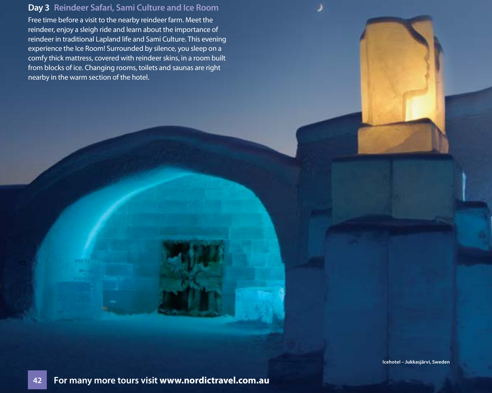
Icehotel – Jukkasjärvi, Sweden

Prices, detailed itinerary and similar tours at www.nordictravel.com.au