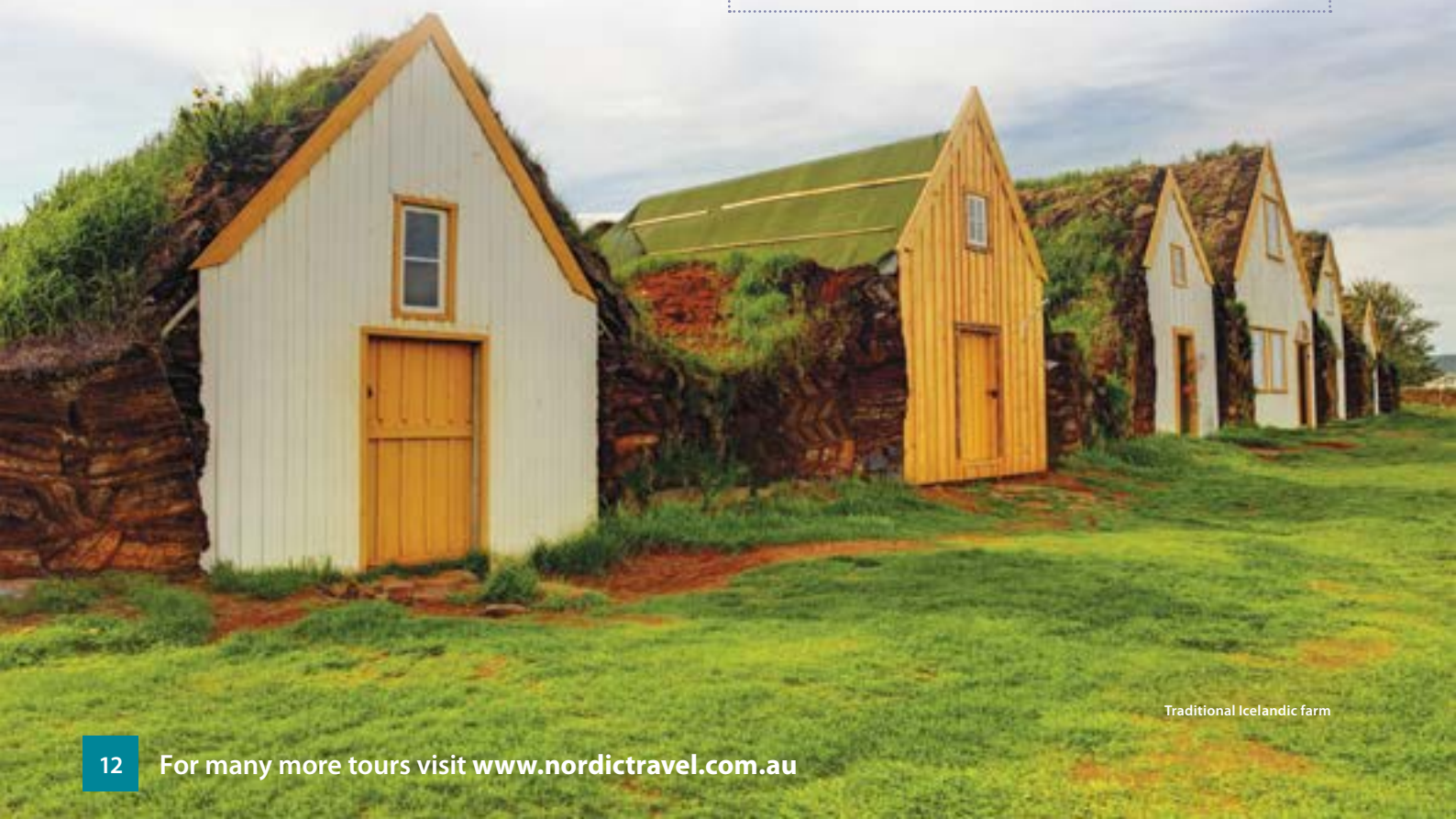
Traditional Icelandic farm