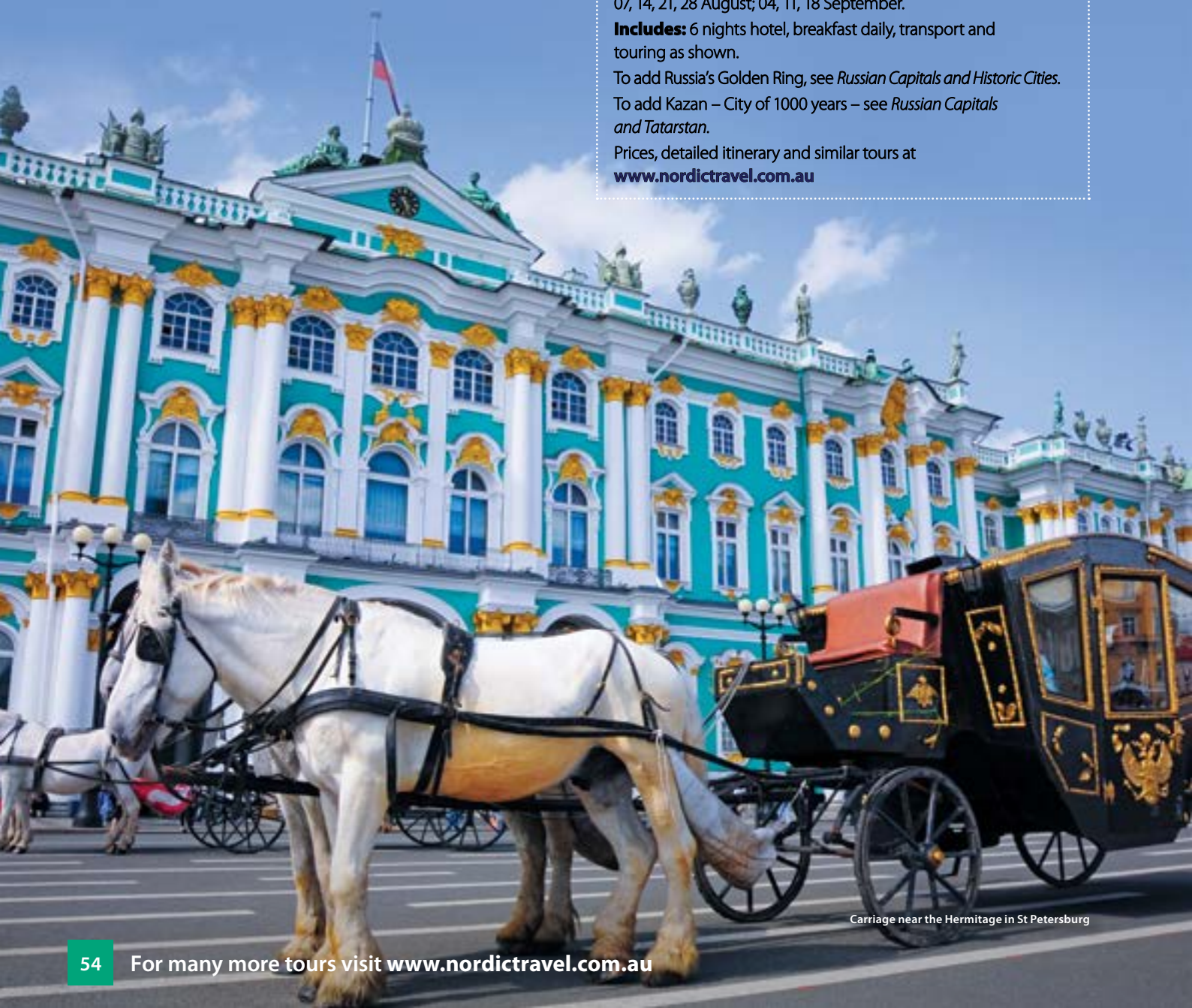
Carriage near the Hermitage in St Petersburg

Prices, detailed itinerary and similar tours at www.nordictravel.com.au