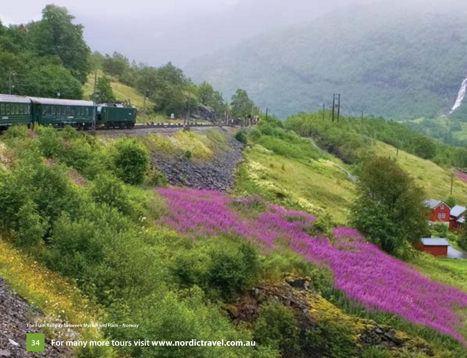
The Flåm Railway between Myrdal and Flåm – Norway