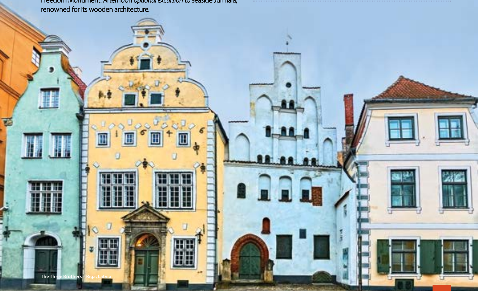
The Three Brothers – Riga, Latvia