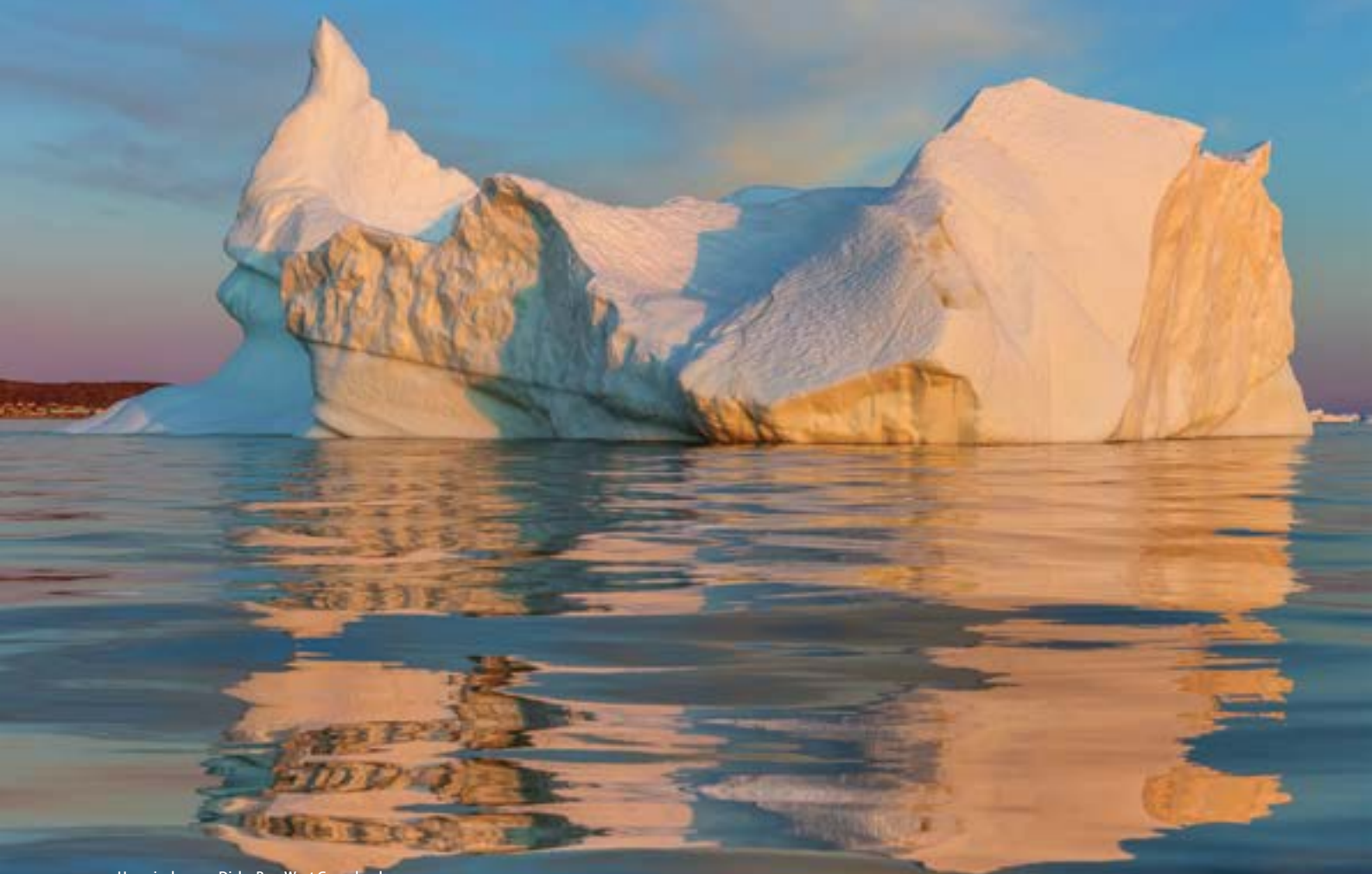
Huge icebergs – Disko Bay, West Greenland

Prices, detailed itinerary and similar tours at www.nordictravel.com.au