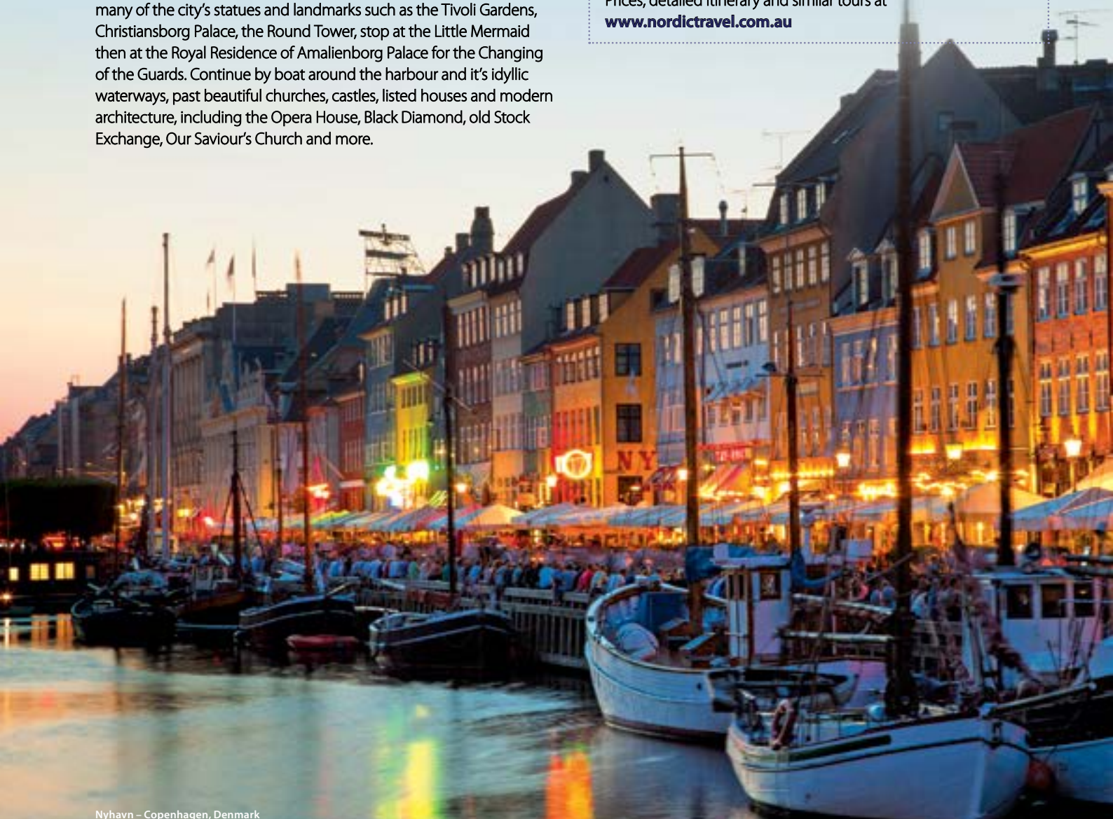
Nyhavn – Copenhagen, Denmark