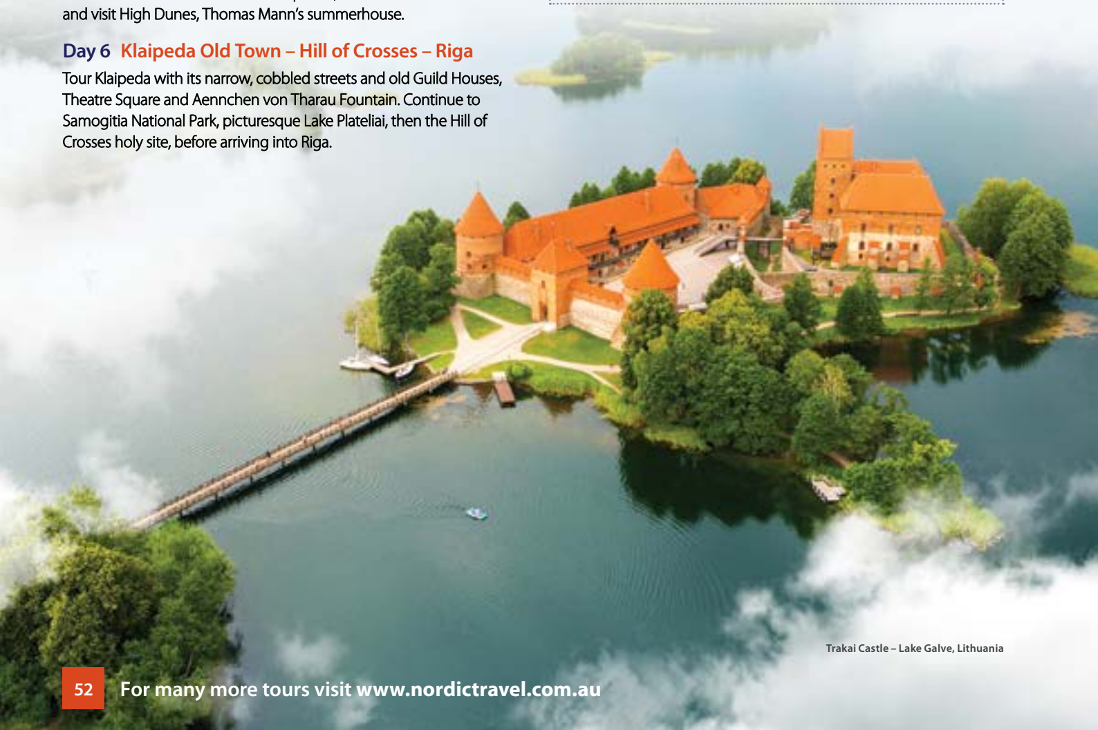
Trakai Castle – Lake Galve, Lithuania