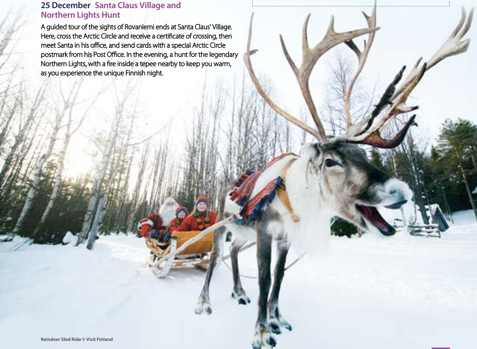
Reindeer Sled Ride