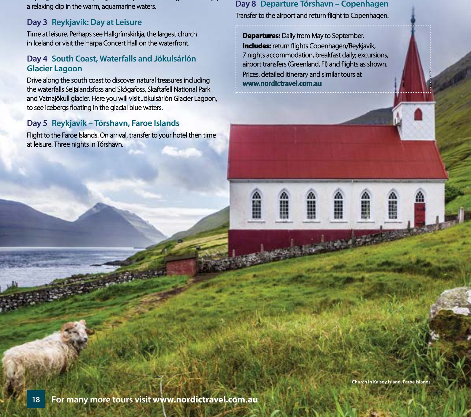
Church in Kalsoy island, Faroe Islands