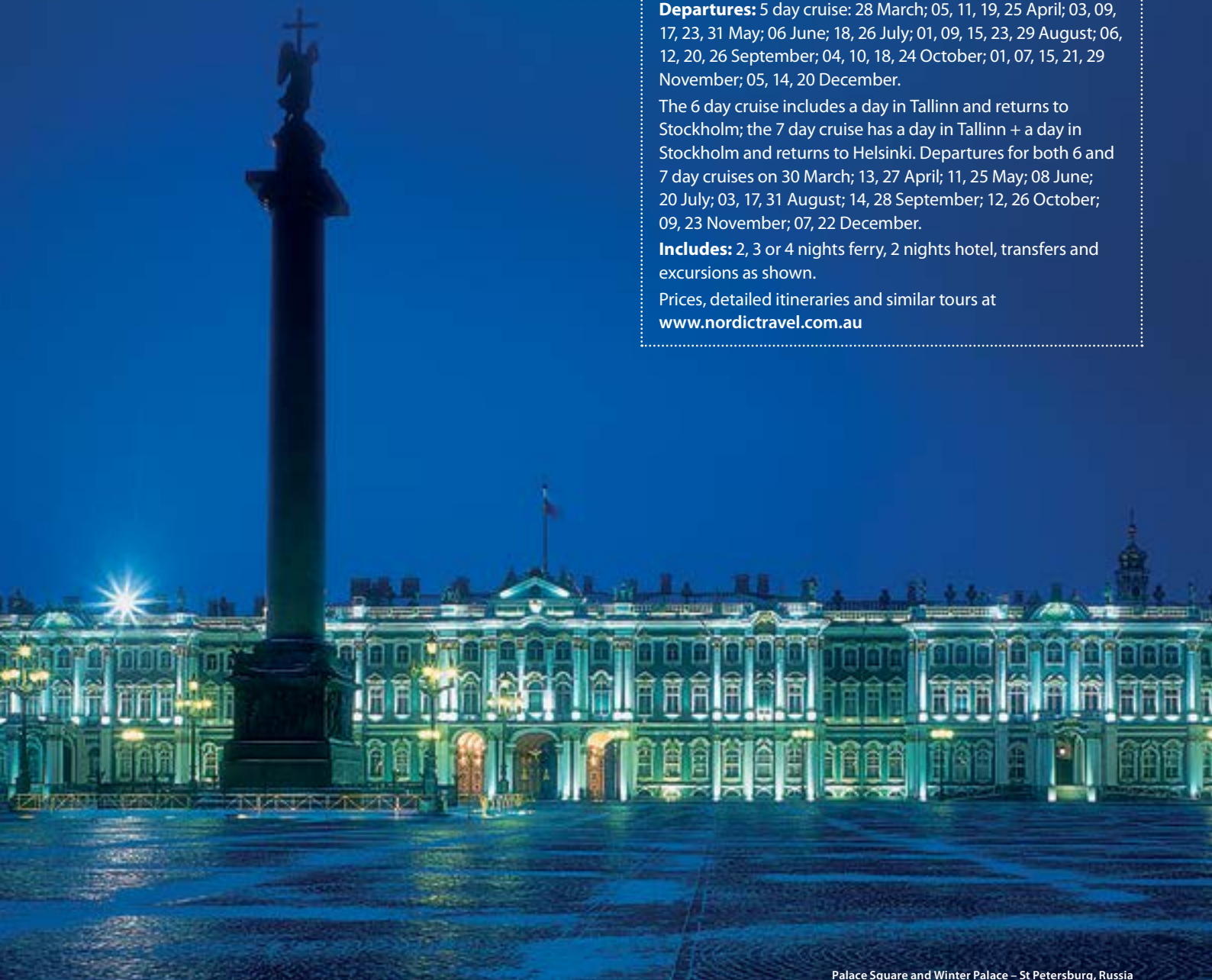
Palace Square and Winter Palace – St Petersburg, Russia

Prices, detailed itineraries and similar tours at www.nordictravel.com.au