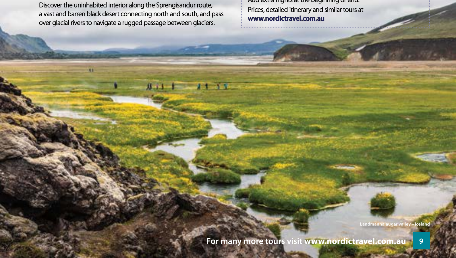
Landmannalaugar valley – Iceland